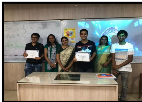
Winners of the Event