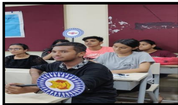
Bidding in the Auction