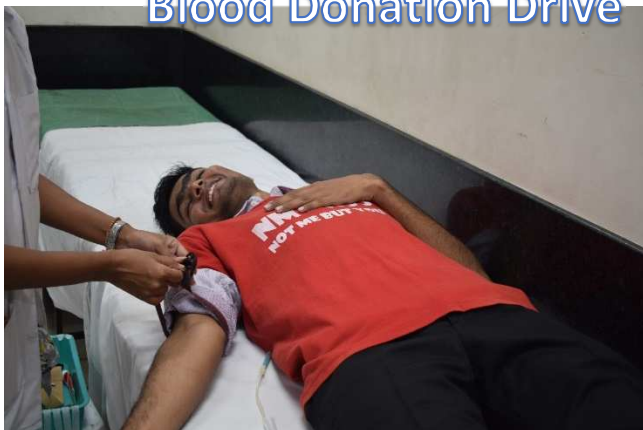
Blood Donation Drive