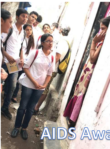
AIDS Awareness Drive