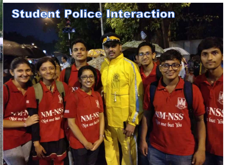
Student Police Interaction