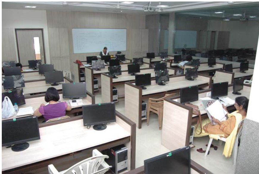
The Computer Lab