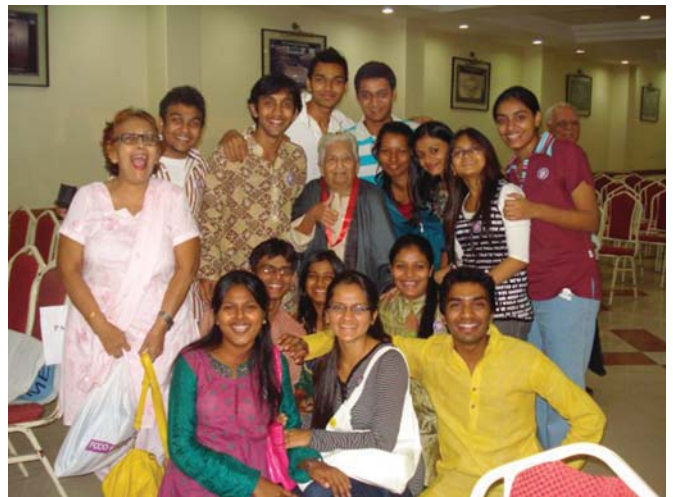
NSS volunteers with the winners of Talent Hunt for senior citizens