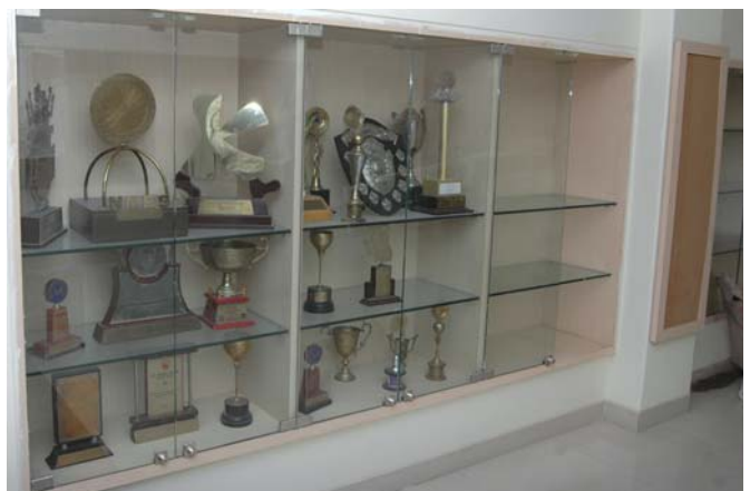
The Trophies Gallery