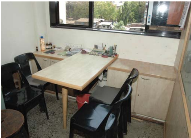
The Health cum Counselling Centre