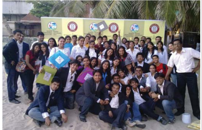
Educating the Young Minds - The World Responsible Youth Day, 3rd January, 2010