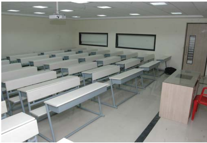
The Class Room