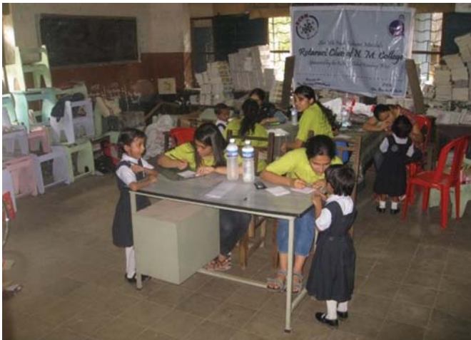
Give me a bright smile - Dental check up at a BMC School