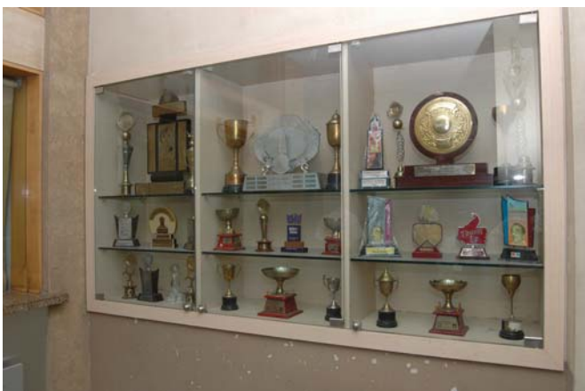
The Trophies Gallery