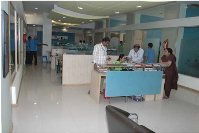
The Administration Office