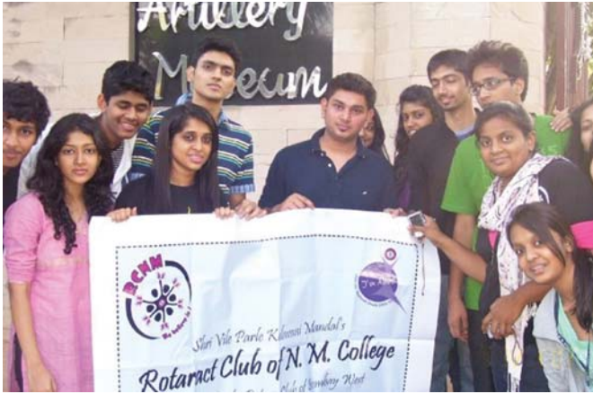
Beyond Borders - IV at the Army Base at Deolali