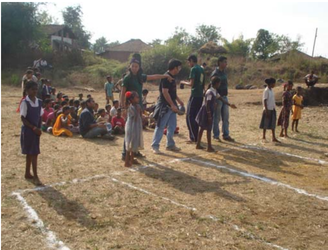
Sports competition for children