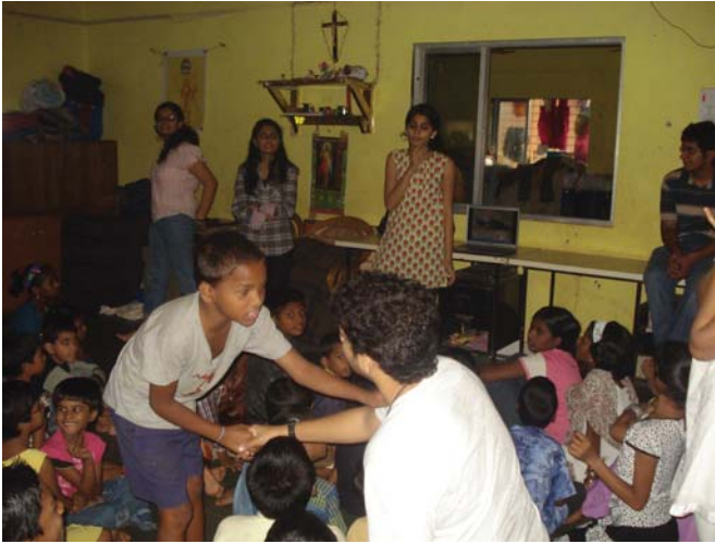
Adopted Area - Teaching Orphans at Buthhelo House