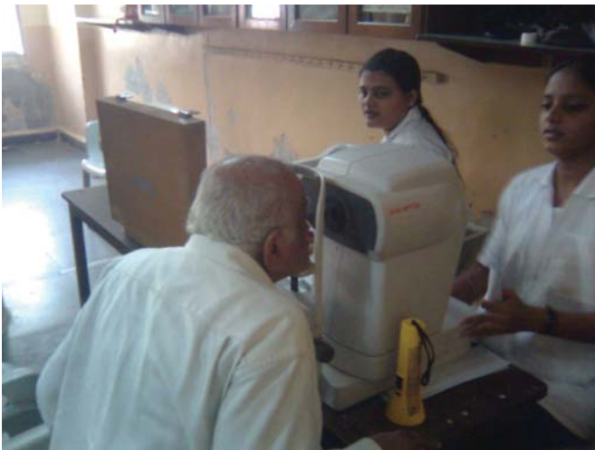
Medical check-up for Senior citizens