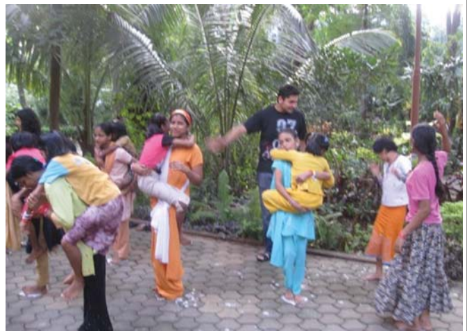
International Friendship Day Celebration with St. Catherines Orphanage