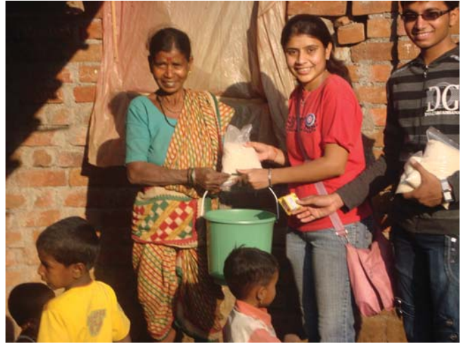
Buckets and Rice were donated to Villagers