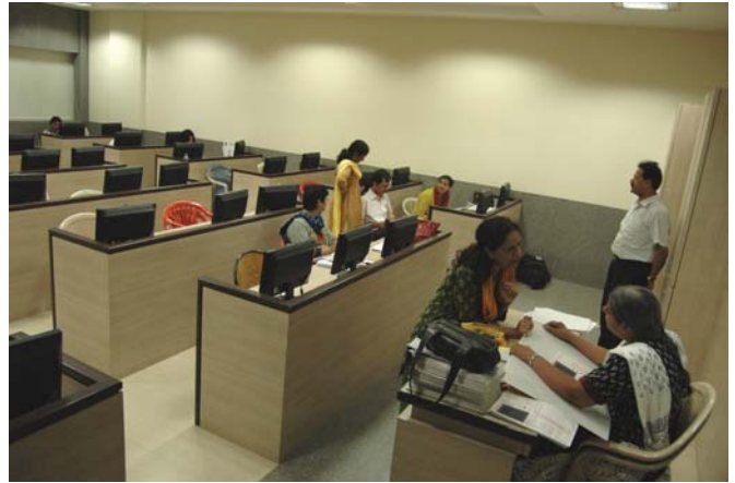
The Computer Lab