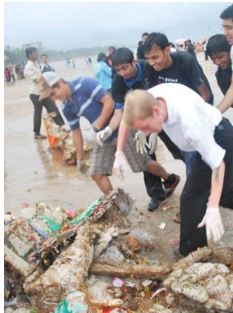
Taking responsibilities for our actions - Beach Cleaning Drive after Ganesh Visarjan.