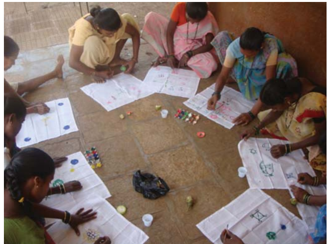
Village women at Art Mela Competition