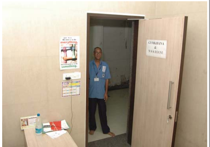
The Gymkhana & N. S. S. Room