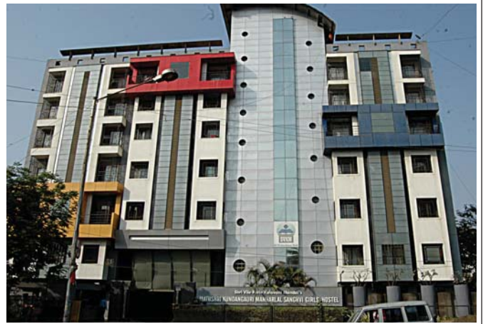
The Girls Hostel Building