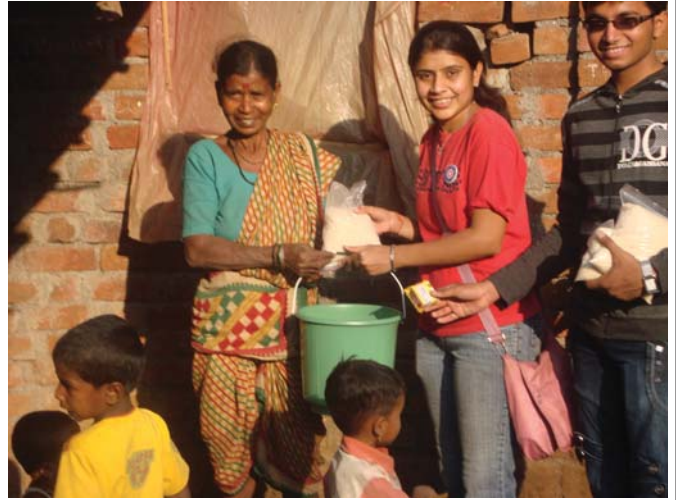
Buckets and Rice were donated to Villagers